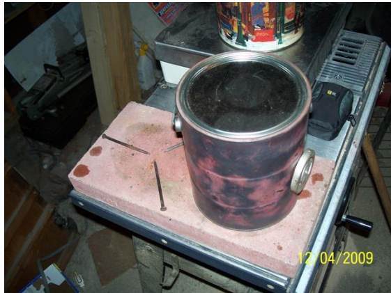
Fig. 9: Quenching char

Although the combustion has stopped, the TLUD still has to cool and that may take several hours. Alternately, the hot char can be transferred to a separate “Quench Can”, with an airtight lid to allow the char to cool in the absence of oxygen. If one transfers hot char, please wear gloves and be careful. Notice how hot the char is at the end of the burn, as shown by the thermometer in Figure 8, which is indicating over 600 Fahrenheit. If the char is placed in a Quench Can, the Toucan fuel container will cool quickly and then may be refueled and relit.