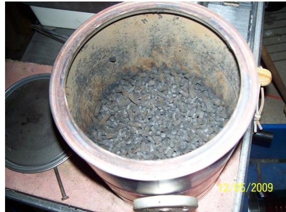
Figure 10: 1G Toucan Biochar

Once cooled, the Toucan can be emptied of biochar. The biochar is much less dense than the original wood pellets. Also, the wood shrinks during pyrolysis and the Toucan will produce about one half the original fuel volume as biochar. Figure 10 shows the finished biochar, which can be used “as is” or crushed. It is added directly to potting soils or gardens, typically at about 10-20% of the root soil volume. Remember to provide additional fertilizer at the same time with the biochar, or it will soak up all the available nutrients in the soil, and then slowly release them back to the plants. Alternately, add the biochar to an active composting process and it will be “good to go” when the composting is completed.