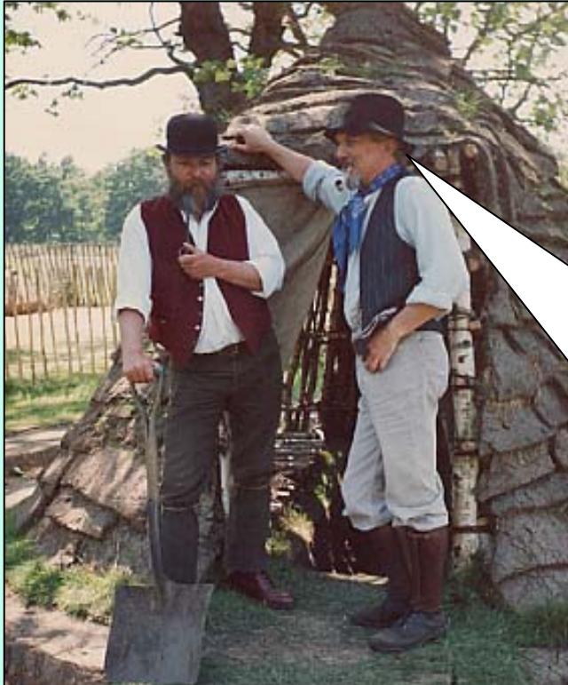
men dressed as 19 th century charcoal makers in UK replica village